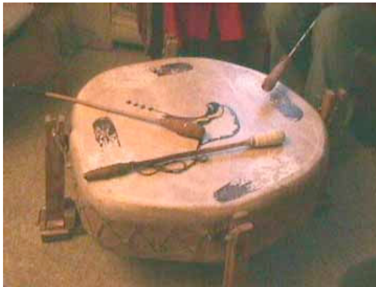
Pow Wow drum – Standing Deer