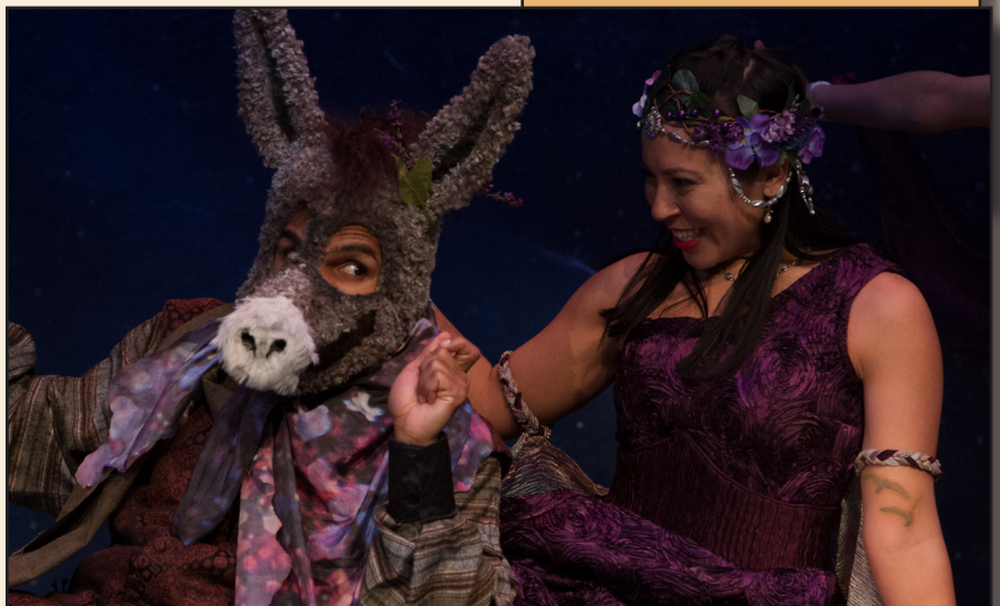
Titania and Bottom in the 2015 touring production of A Midsummer Night's Dream .

The story of Pyramus and Thisbe is found in Ovid's Metamorphoses , and its plot is strikingly similar to that of another Shakespeare play written around the same time as Midsummer — Romeo & Juliet .