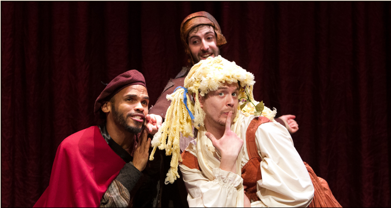
Snout (as the Wall), Flute (as Thisbe) and Bottom (as Pyramus) in the 2015 touring production of A Midsummer Night's Dream .