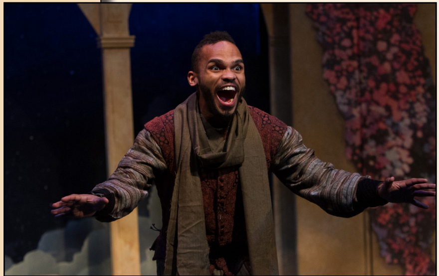
Bottom from the 2015 touring production of A Midsummer Night's Dream .

The names of the Mechanicals mostly reflect their occupations. Bottom, the weaver, is named for a skein of yarn or thread, called a "bottom." The name of Quince, the carpenter, suggests "quines," or blocks of wood used by carpenters in building. Flute is a bellows mender-- the bellows has a fluted shape, and was used to compress air to stoke a fire or to produce sound (as in a church organ). Snout, the tinker, would have been a mender of pots, pans and kettles-- the spout of a kettle was often called a "snout" in Shakespeare's time. Snug, is a joiner, one who manufactures cabinets and other jointed furniture made of snug-fitting pieces of wood. Finally, in Shakespeare's time, tailors were usually depicted as abjectly poor and thus, rail-thin from hunger— in other words, "starvelings."