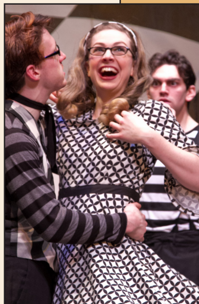
Demetrius and Lysander fight over Helena in the 2014 touring production of A Midsummer Night's Dream .

Isaac Asimov notes that "there is a folk belief that extreme heat is a cause of madness (hence the phrase 'midsummer madness') and this is not entirely a fable. The higher the sun and the longer it beats down, the more likely one is to get sunstroke, and mild attacks of sunstroke could be conducive to all sorts of hallucinatory experiences. Midsummer, then, is the time when people are most apt to imagine fantastic experiences."