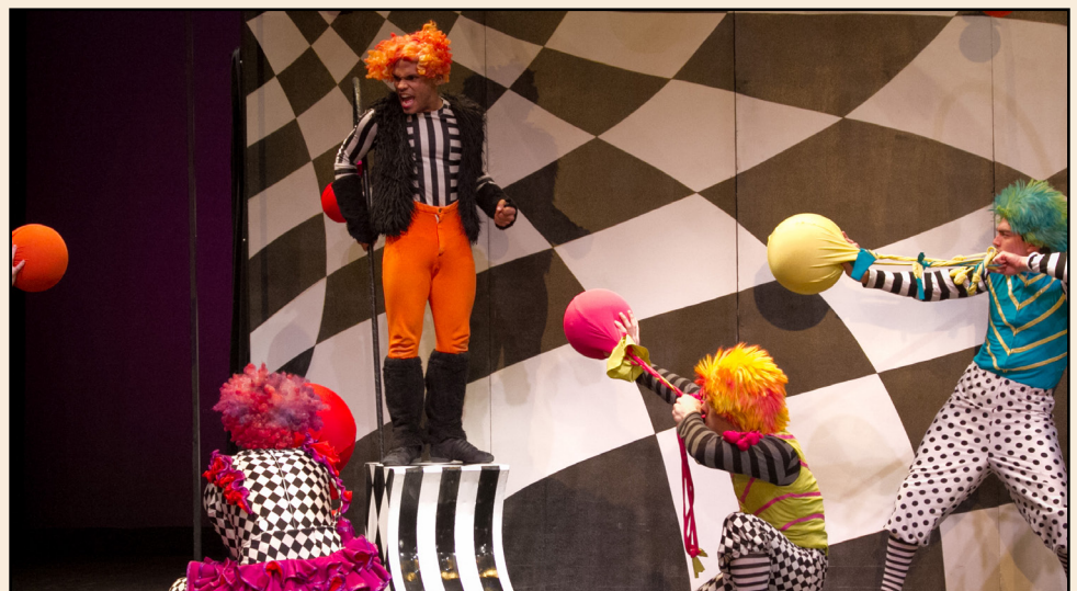
Puck and the Fairies from the 2014 touring production of A Midsummer Night's Dream .