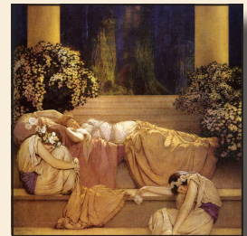
Daybreak (l) and Sleeping Beauty (r) by Maxfield Parrish