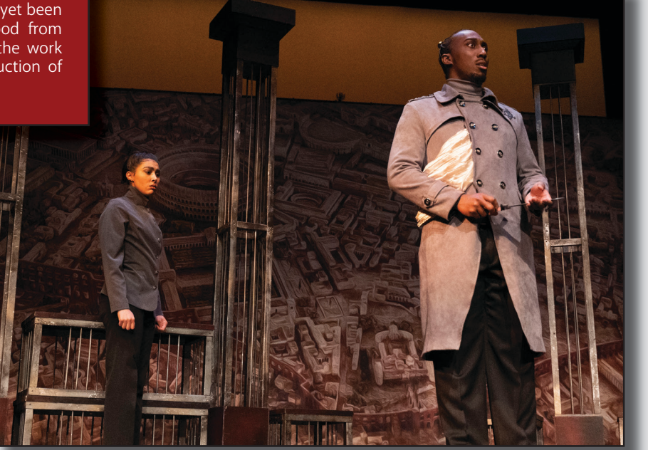
Cassius contemplates his capture in the 2021 touring production of JULIUS CAESAR.