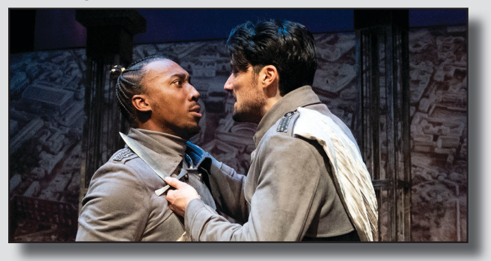
Brutus confronts Cassius in the 2021 touring production of JULIUS CAESAR.

hilts - handle of the sword smatch- slight touch or trace