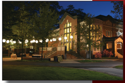
The Shakespeare Theatre of New Jersey's Main Stage, The F.M. Kirby Theatre.