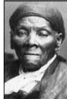
A photograph of Harriet Tubman taken later in her life.